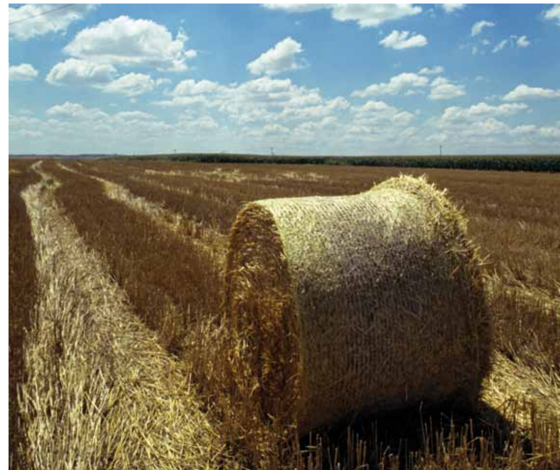
36. Characteristic "rural" scene, Evros region.