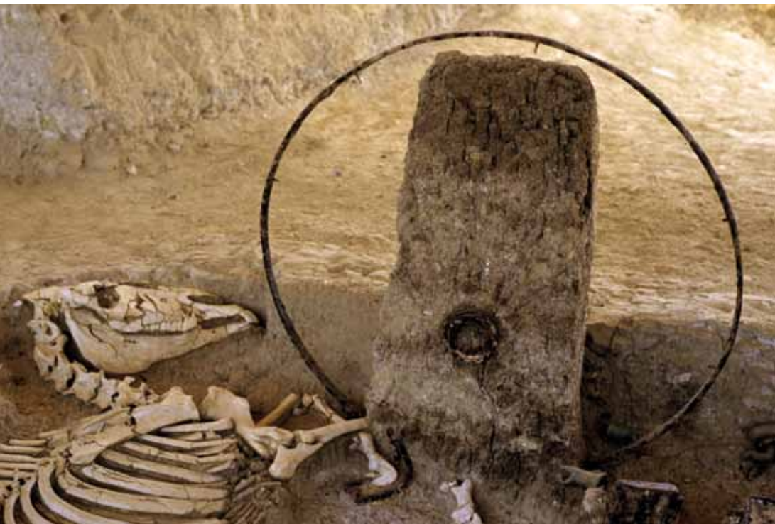
35. Part of the archeological finds at Mikri Doxipara.