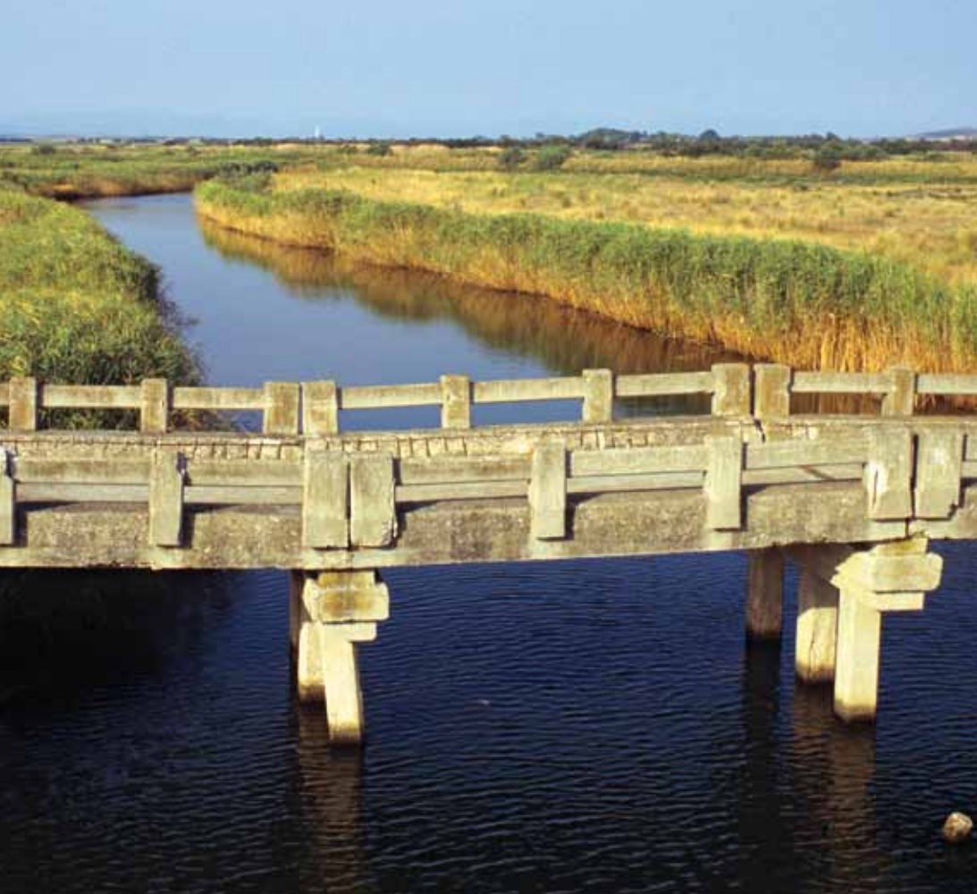
17. The natural channel through which the waters of Lake Ismarida flow to the sea.

monuments which date back to the Byzantine period (Hellenistic mansion, Roman propylon, ruins of Early-Christian churches and a monastery). Also worth visiting are the ancient theater (sitting capacity: 3,000 at the location of "Kambana"); the 4 th c. BC sanctuary (dedicated possibly to Dionysus).