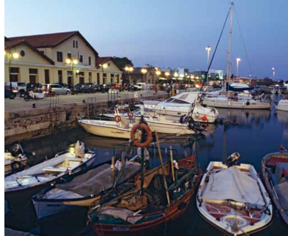
21. The small harbour of Alexandroupolis.