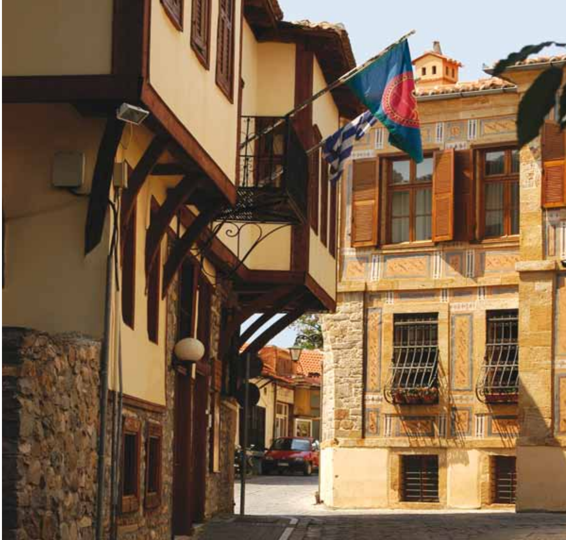
8. View of Xanthi's old town. Left: the Municipal Gallery building.