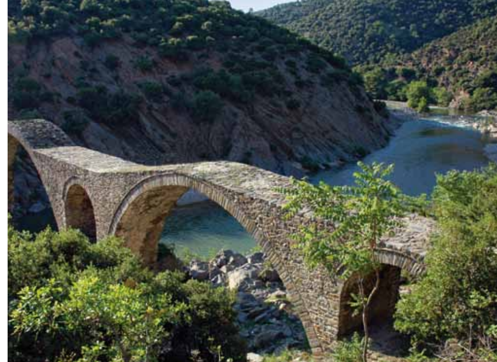
14. The stone bridge over Kompsatos River.

of artifacts created by the Roma (gypsies) basket weavers.