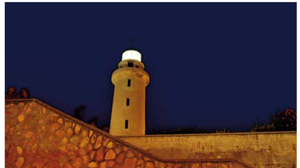
20. The lighthouse of Alexandroupolis, the city's landmark.

• The Ethnological Museum of Thrace (housed in an 1899 restored mansion). Its exhibits include Aggela Yannakidou's collection