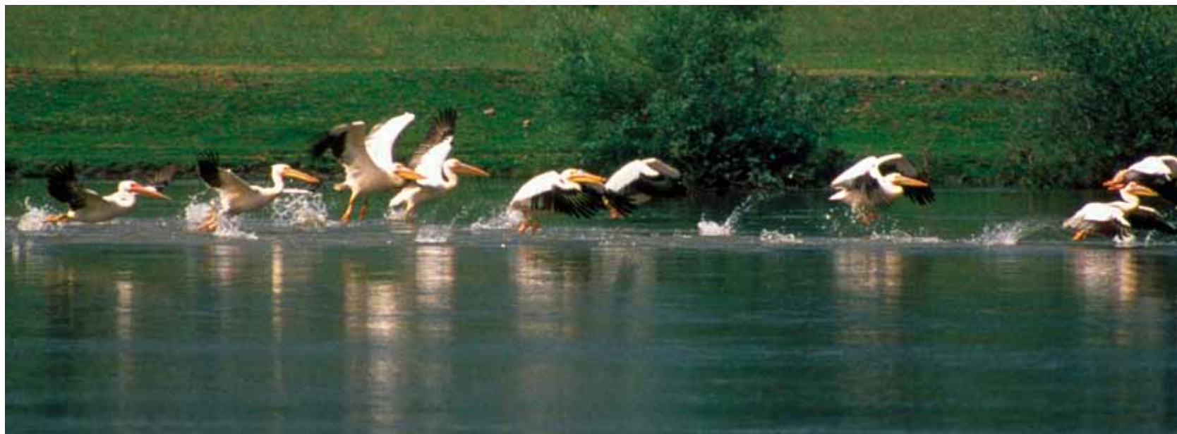
27. Flock of Great White Pelicans (pelecanus onocrotalus) at the Evros riverside.

Alexius I Comnenus. The ruins of the Turkish public baths and the aqueduct built during the Turkish Occupation lie nearby.