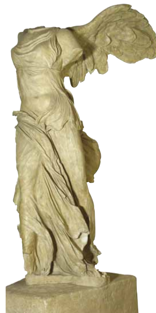
39. The marble statue of Nike of Samothrace housed at present in the Louvre Museum.

Therma derives its name from the hot sulphur springs of the area that have been known for their healing effects since Byzantine times. The entire area is a riot of greenery with plane and chestnut trees, wild strawberry trees (arbutus unedo), and myrtles (especially in the valley of the Fonia River, where you can find many "vathres"). Small boats that run excursion trips to the S coast of Samothrace start from the island's only anchorage, Kamariotissa. Distance from Chora: 12 km NE.