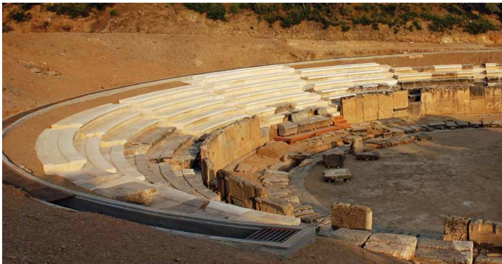
16. The ancient theatre (Hellenistic period) at the location of “Cabana”, Maroneia.