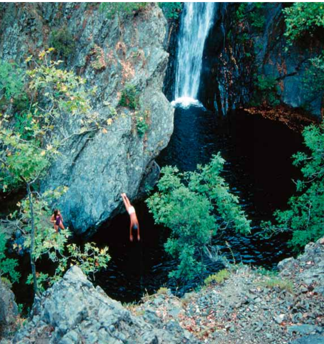
41. Vathra (natural pool) at Mount Saos, Samothrace Island.