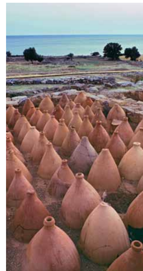
25. Mesimvria-Zoni archeological site. House floor insulation using amphorae placed upside down.

24. Section of the western wall, Mesimvria-Zoni archeological site.