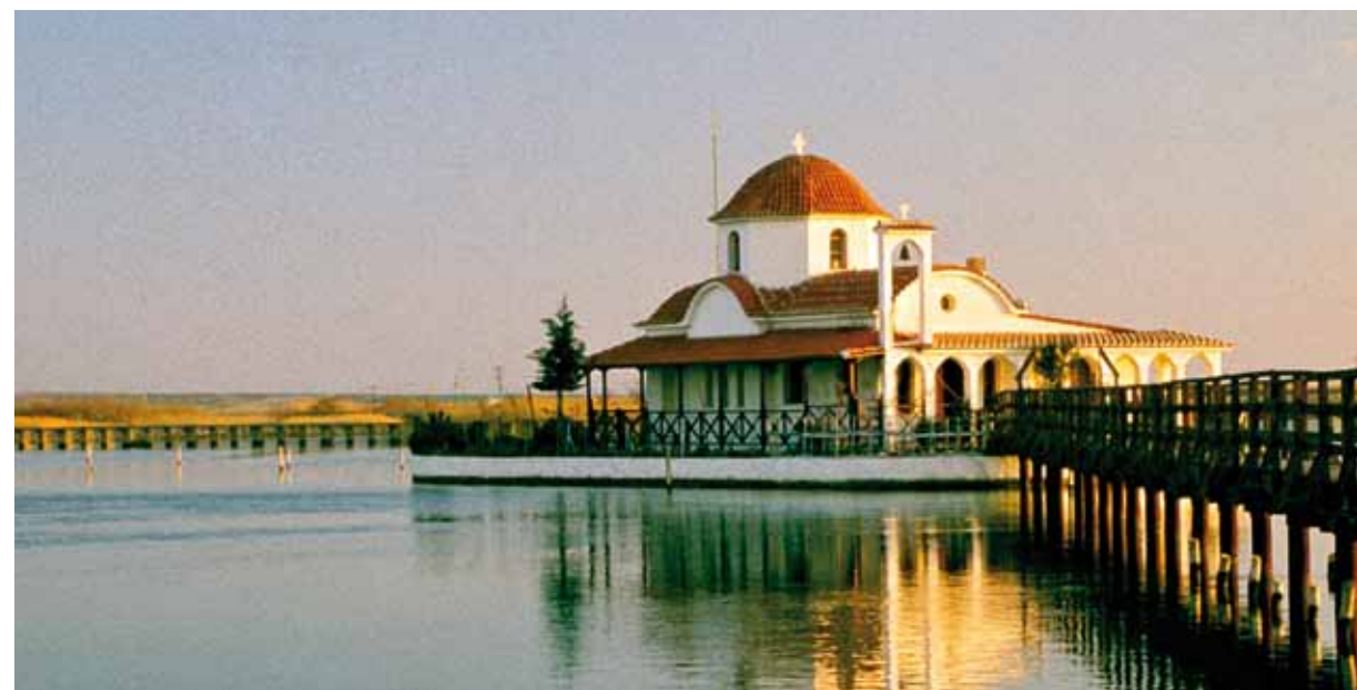
9. The Ayios Nikolaos Monastery, Porto Lagos.