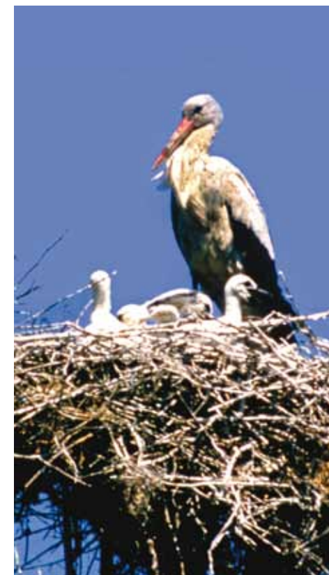
18. A stork's nest in the greater Vistonida Lake area.