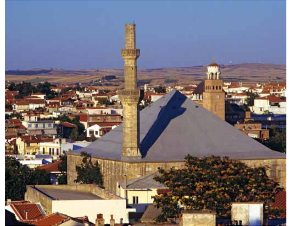
34. Didimoticho. The Grand Mosque (1420). Part of the city is visible in the background.