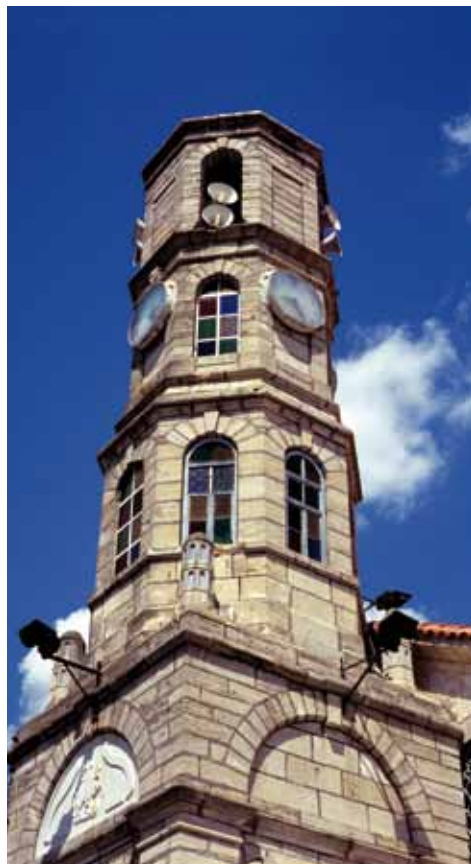
29. The Ayios Georgios Holy Metropolitan Church, Soufli. Its three-story belfry (1910) is 25 metres high.

Didimotiho is a delightful border town (population: 8,600) with a long historical past, and well-preserved Classical, Byzantine, and Ottoman monuments. It is built amphitheatrically on an abrupt hill, on the riverside of Erithropotamos (Red River), a tributary of Evros. Some claim that Didimotiho took its name from the double strand of Byzantine walls; others argue that the city fortress together with its twin on the opposite hill of Ayia Petra ( kas-