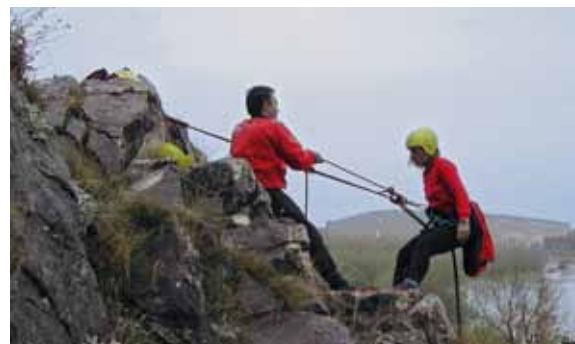
5.6.7. Xanthi District as well as the entire region of Thrace are a favourite destination among those nature lovers who delight in adventure sports.

a diocese seat between the 5 th and 8 th c. AD.