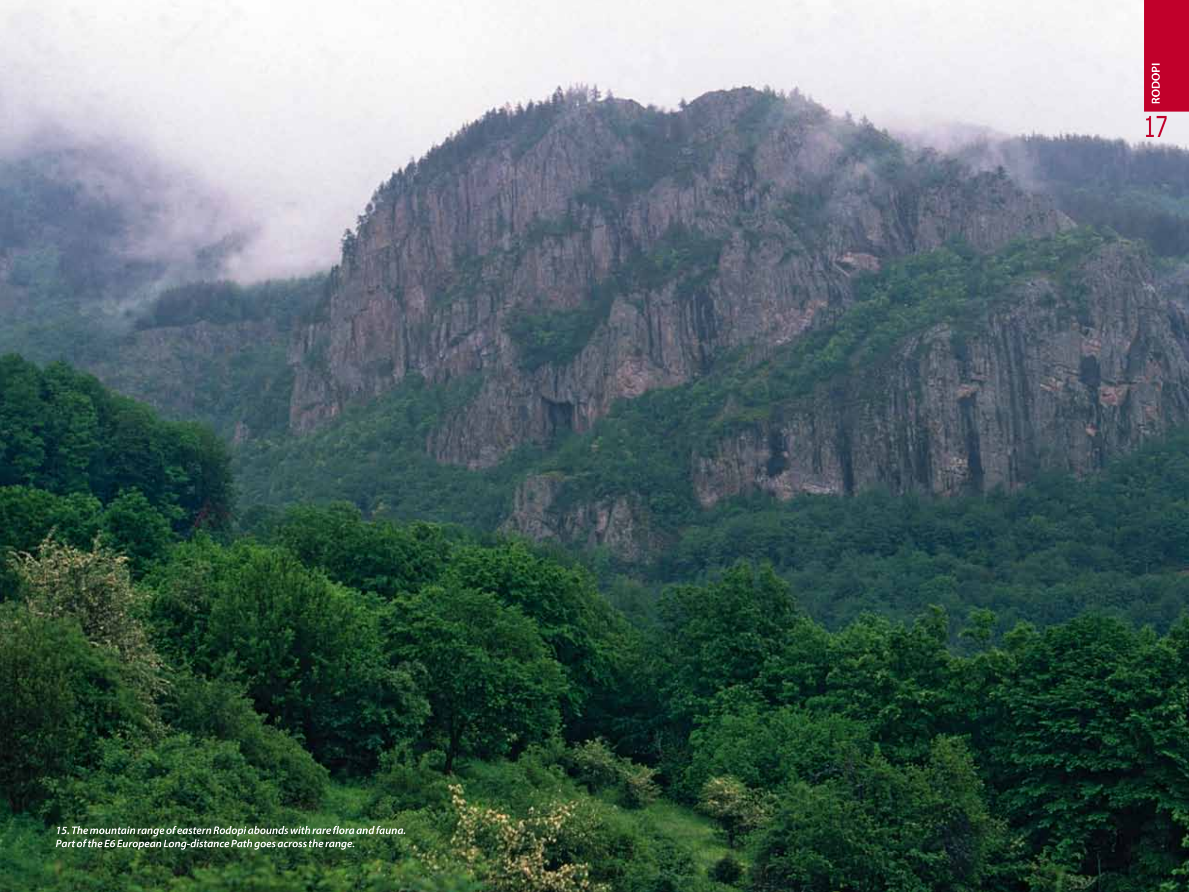
15. The mountain range of eastern Rodopi abounds with rare flora and fauna. Part of the E6 European Long-distance Path goes across the range.