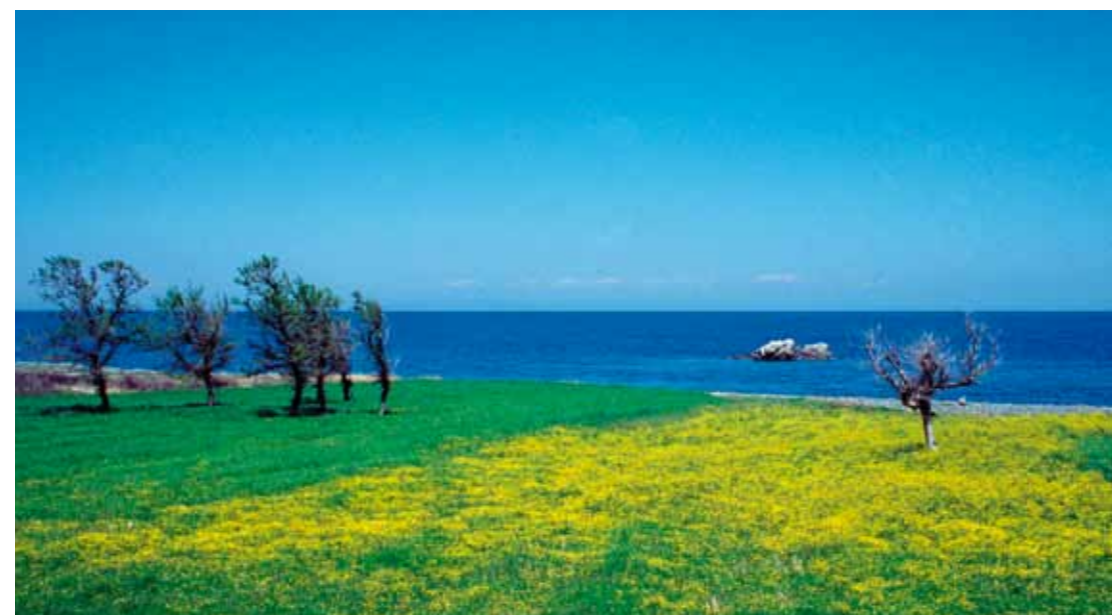
42. A typical landscape of the northern part of Samothrace.