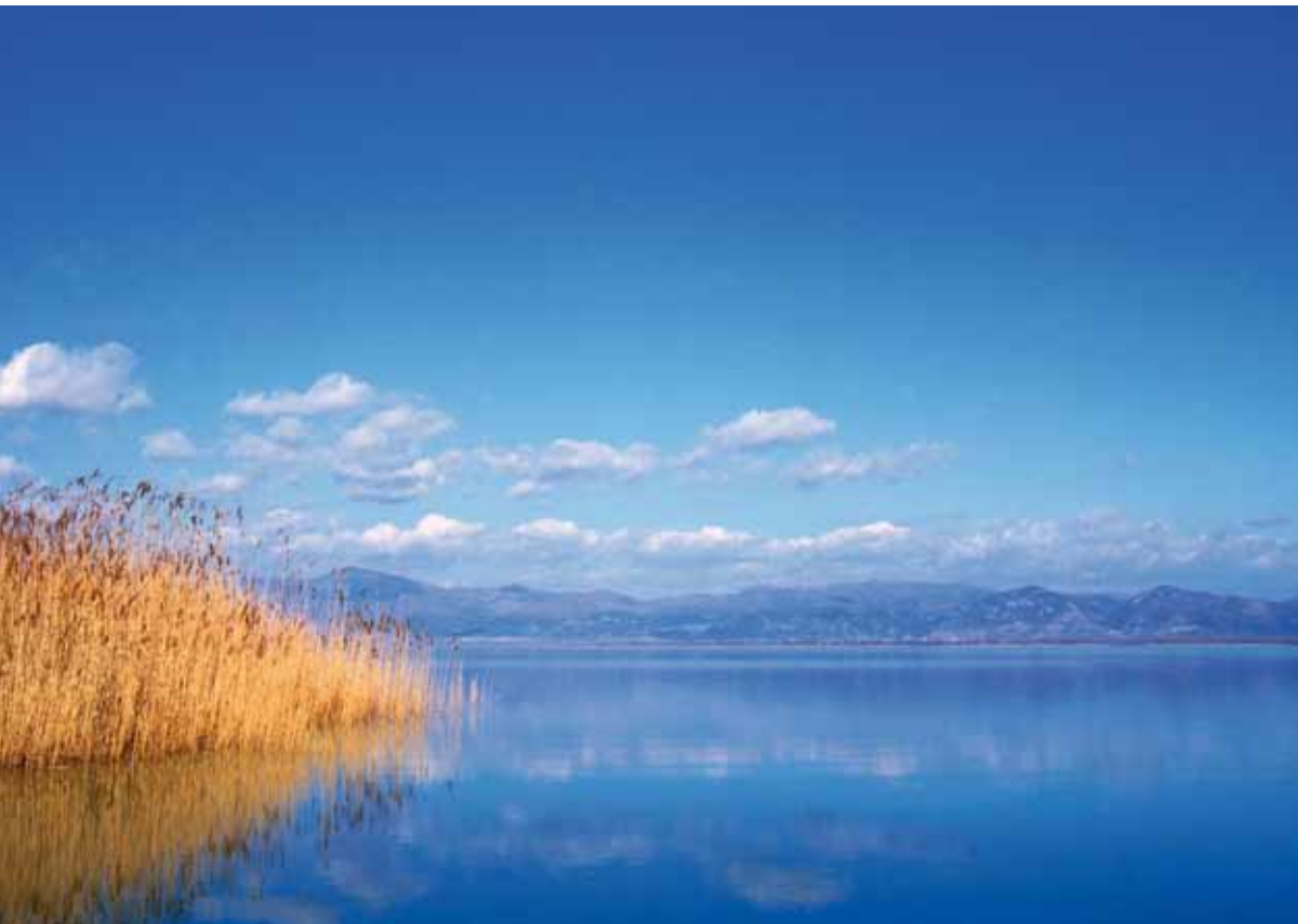
11. Vistonida Lake.

R odopi is a region of particular interest legendary for its scenery, its scope of activities and attractions and its hospitality. It has many beautiful vistas (Lakes Vistonida and Ismarida), rich flora and fauna found on the mountainous part on the east of the prefecture, archaeological sites, and traditional small villages. Its capital is Komotini, a city with a long historic course throughout which the Christian and Muslim populations have co-existed peacefully.