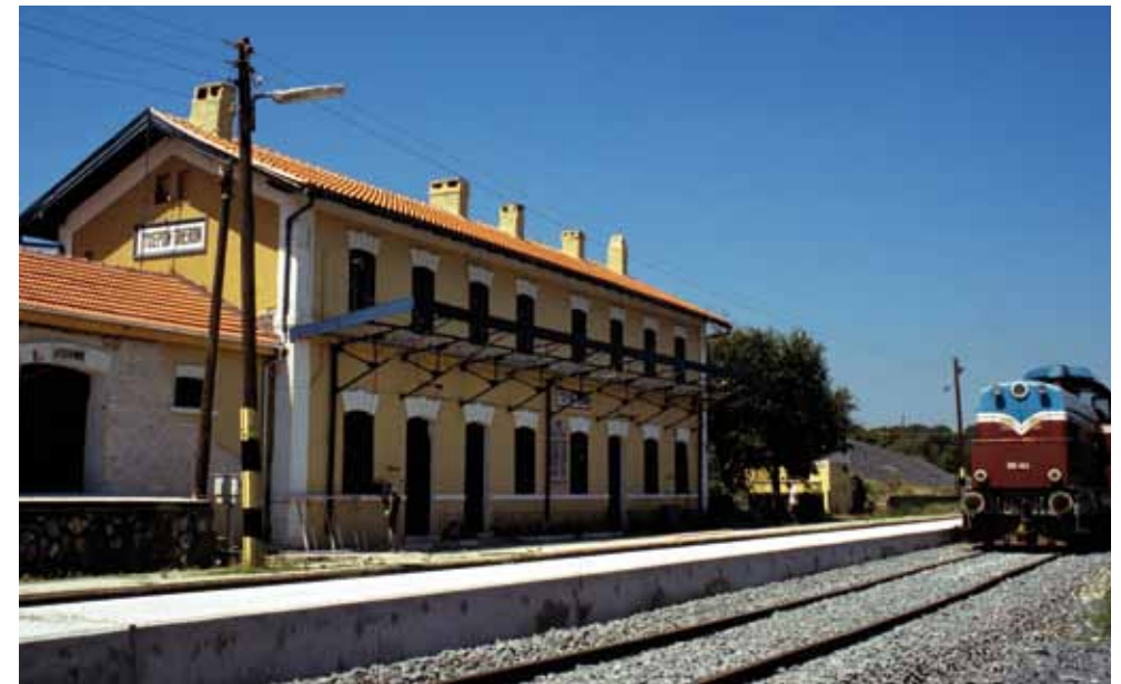
31. The impressive Brika Mansion (1890), at Soufli, which has been converted into a Folk Art and History Museum.

tro didymariko ) gave their name to Didimotiho. In Byzantine times, the town then named Demotika became the seat of the empire in 1325 during the reign of Emperor Andronicus III Paleologus. After Thrace was captured by the Ottoman Turks, it became the Turkish capital for a short time. It was then that its churches (more than 100 in the area) were turned into mosques. During the years of Turkish rule, the organized guilds founded by craftsmen engaged in various trades contributed to the city's prosperity. Didimotiho was also occupied by the Russians during the Russo-Turkish War and later by the Bulgarians. It was liberated in 1920 according to the Treaty of Neuilly after five and a half centuries of Turkish occupation. Distance from Alexandroupolis: 98 km NE.