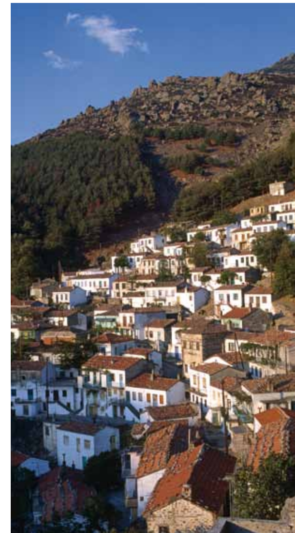
38. View of Hora, Samothrace.