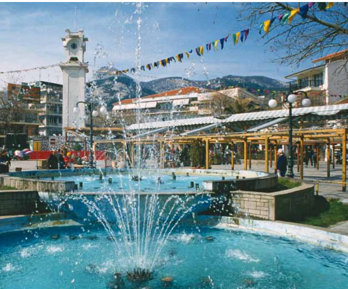
3. Xanthi's central Dimokratia Square and its distinctive clock tower.

T he mountains of Rodopi and its rioting forests, the serpentine journey of Nestos river, lake Vistonida, the exquisite old city of Xanthi and the mountain villages within the confines of the prefecture attract a great deal of visitors.