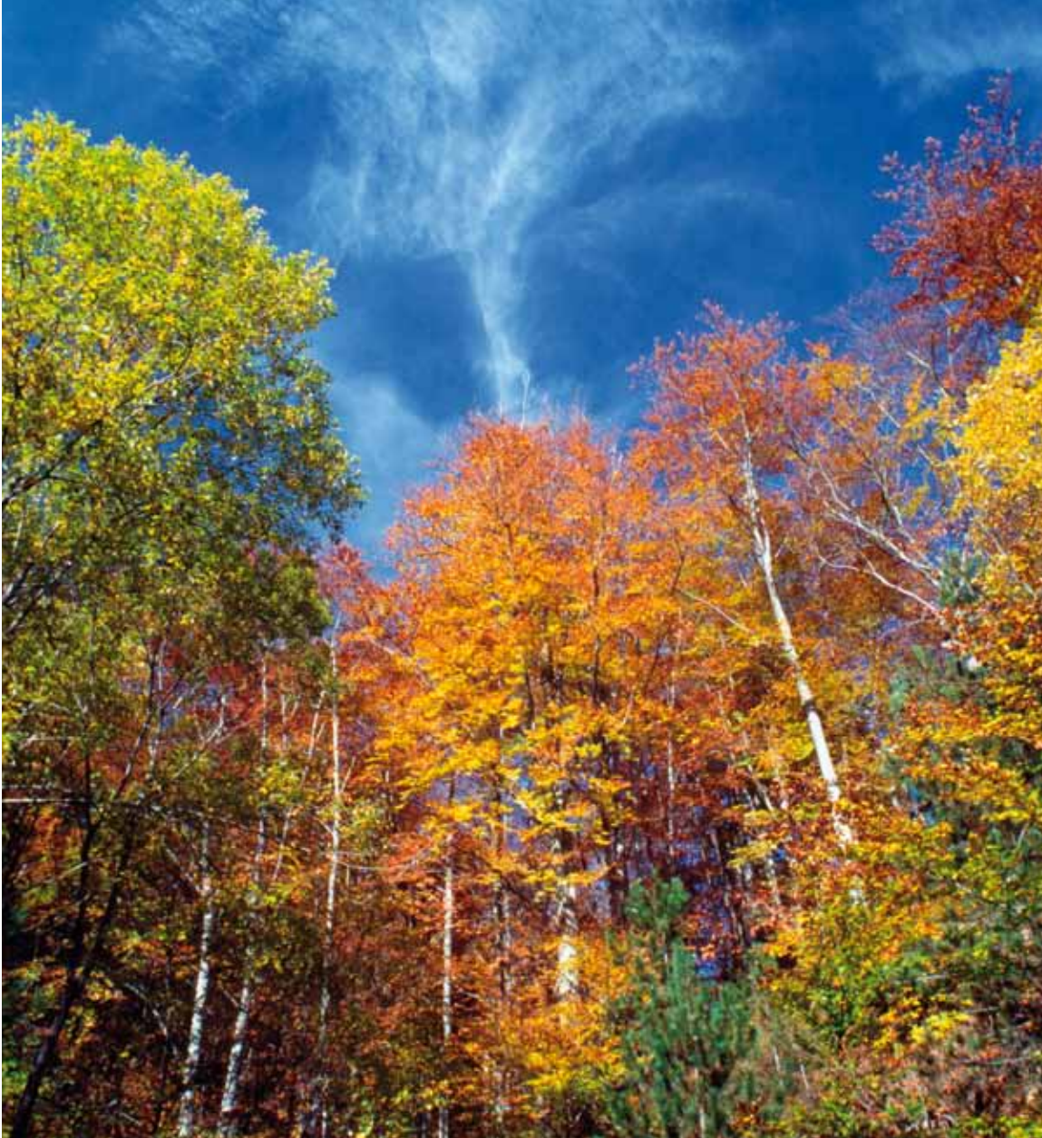
10. The Haidou beech forest covers 12 hectares of land and has been listed as a natural monument.

Built next to Nestos River, Stavroupolis is the second largest city of the prefecture and captivates visitors with its tranquility. It is worth taking a stroll along the narrow stone-paved alleys to admire the traditional architecture of the town's houses. Most of them are made of stone with sahnisia (closed balconies) and fireplaces projecting from the upper floors onto the street. After the 1960's it became a trade centre for tobacco growing and processing. Nowadays, it is the only mountain municipality of the Prefecture of Xanthi and the starting point for forays into the greater area. Distance from Xanthi: 28 km NW.