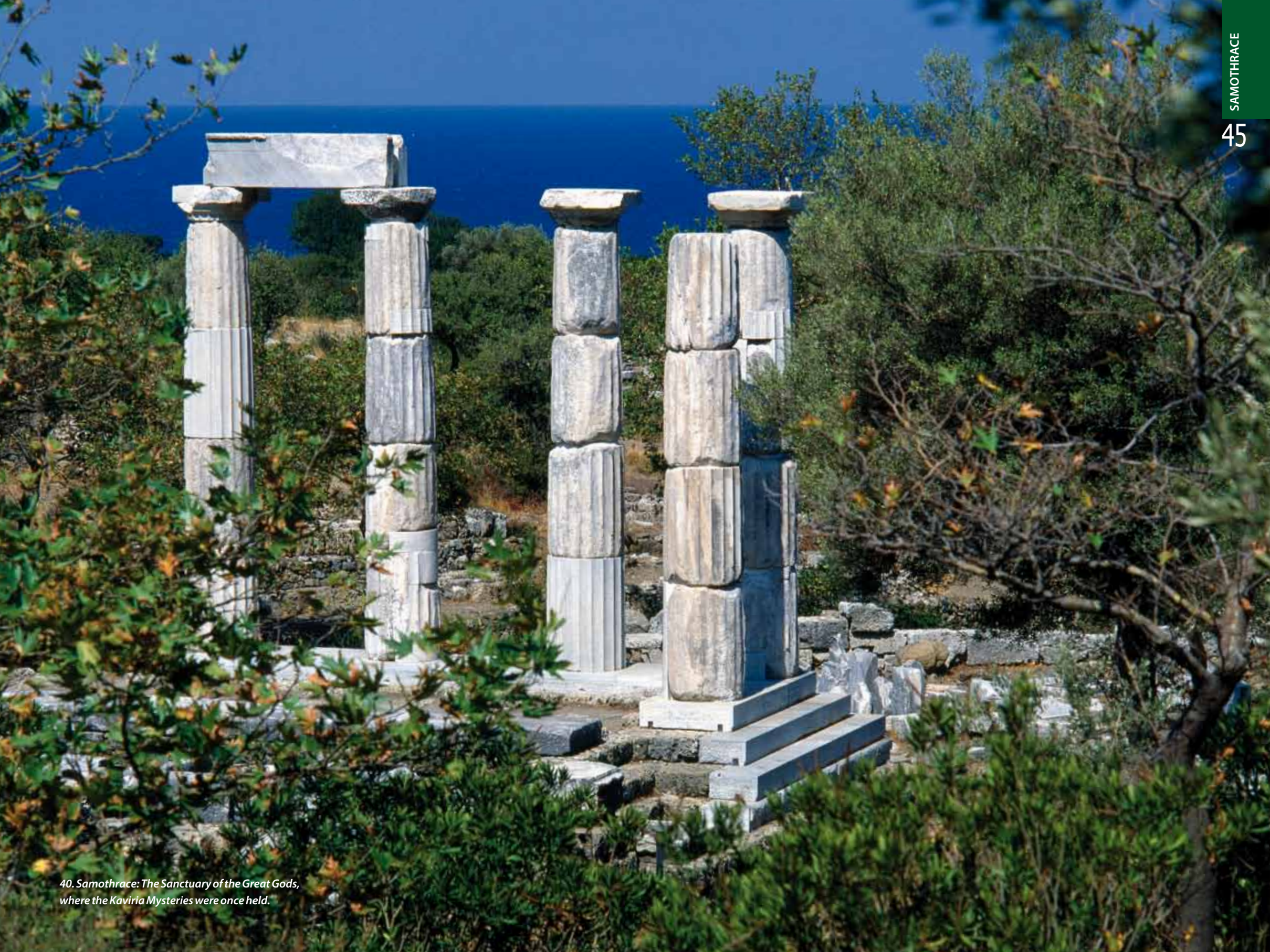
40. Samothrace: The Sanctuary of the Great Gods, where the Kaviria Mysteries were once held.