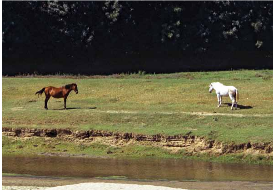
33. Erithropotamos riverside.