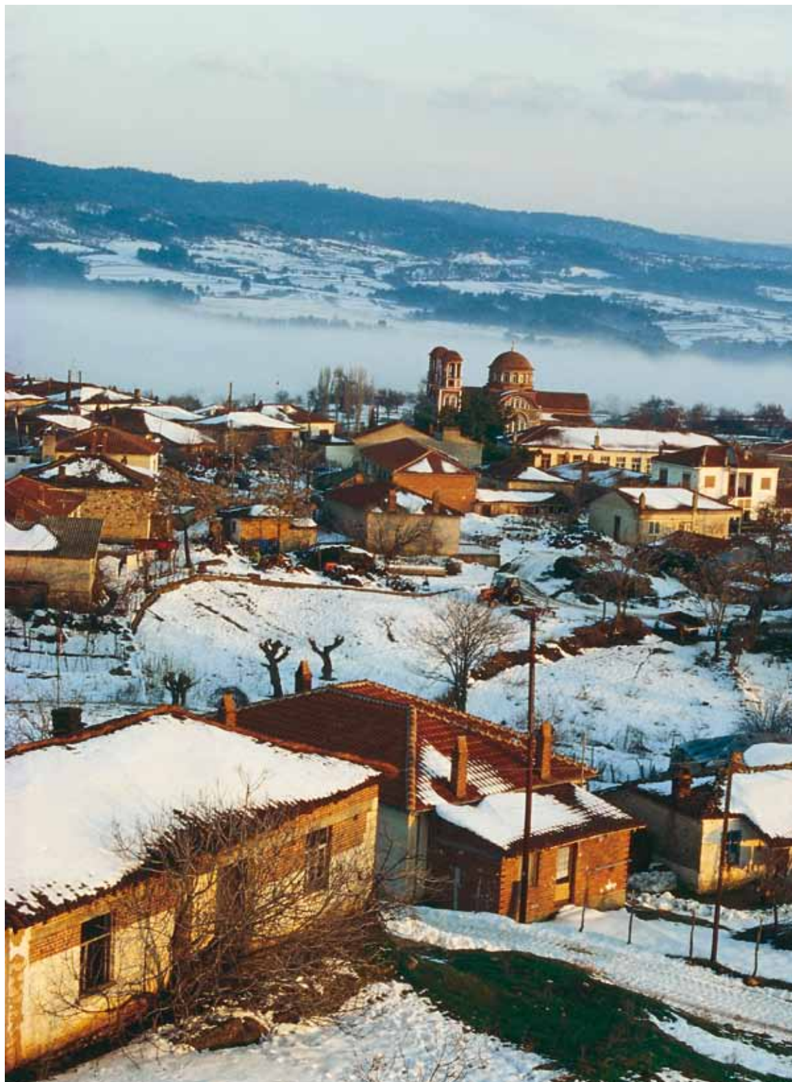
28. The village of Dadia next to the forest bearing the same name.

also featuring an inn), located at the entrance of the village near the lake, visitors may view in the small exhibit hall a good selection of fossils from the greater area.