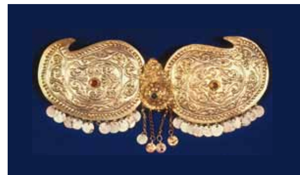
22. Traditional Thracian silver-wrought piece of jewellery.

Municipality of Alexandroupolis website: www.alexpolis.gr