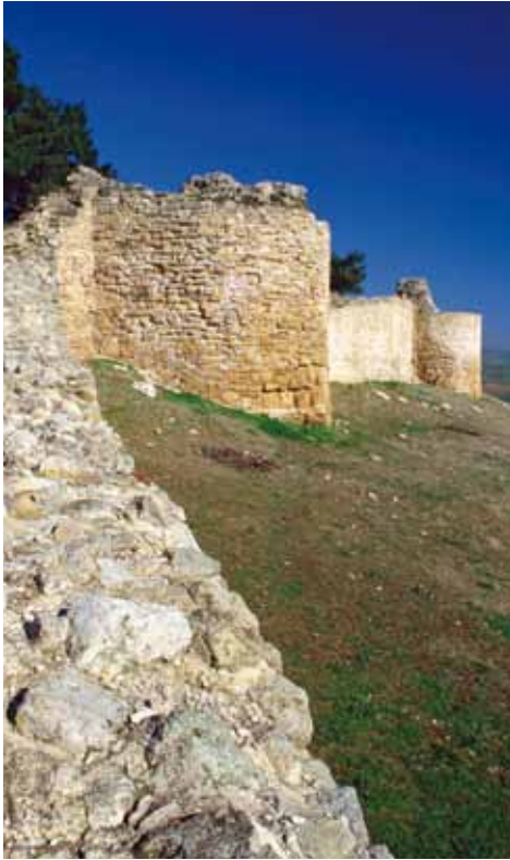
32. View from the castle's walls, Didimoticho.

display the history of the Hellenic armed forces from their foundation to the present.