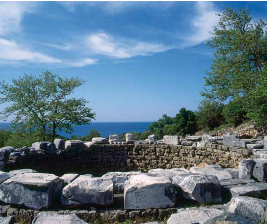
37. Samothrace: The Tholos (Vault) Building dedicated by Queen Arsinoe II, Sanctuary of the Great Gods.