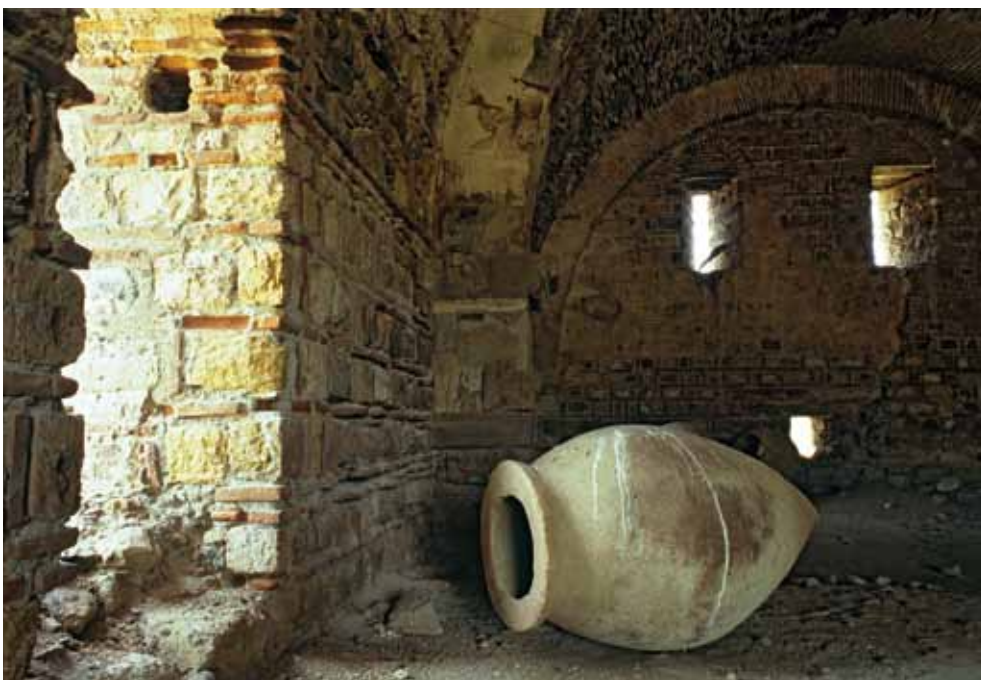
26. Detail from the "Hana" building, ancient Traianoupolis.

river of the Balkan Peninsula. It starts its journey in the Rila mountains of Bulgaria (as does Nestos which also enters into the Aegean Sea). Evros flows through mountains, valleys, and plains and debouches into the Thracian Sea, having covered during its course a total of 530 km out of which 204 km are in Greek soil. The great value of the Evros River Delta lies in its rich avifauna: Of the 423 bird species of Greece, 314 have been recorded to have the Evros Delta as their habitat! The Delta, 11 km wide, is a biotope for nesting birds, large flocks of wintering aquatic birds from the northern regions of Central and Eastern Europe, and a gathering and resting place for large migratory bird populations. In addition to the avifauna, 46 species of fish, 7 species of amphibians, 21 species of reptiles, and over 40 species of mammals make their home at the Evros River Delta.