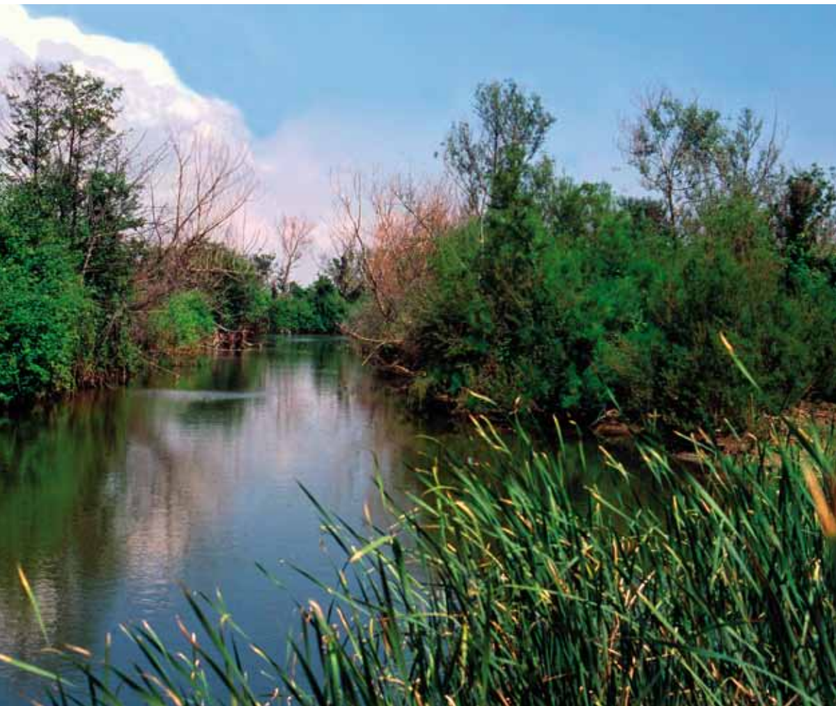
19. Lush vegetation along the Evros riverside.

Landscapes where nature has excelled itself in beauty such as the Evros River Delta and the Dadia Forest, sites of great archaeological significance, Byzantine monuments and churches, a remarkable tourism infrastructure, and a rich cultural heritage, compose a captivating picture of Greece's northeastern part. The district of Evros borders on Bulgaria to the N-NW; on the E it is divided from Turkey by Evros River; on the W it borders on the district of Rodopi; to the S the district of Evros bounds the Thracian Sea.